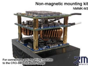
Figure 1: Example Mounting

A set of non and low-magnetic screws and mounts for use with our CRO-SM3 and related products. Ideal for creating highly compact induction heater systems and tank capacitors.